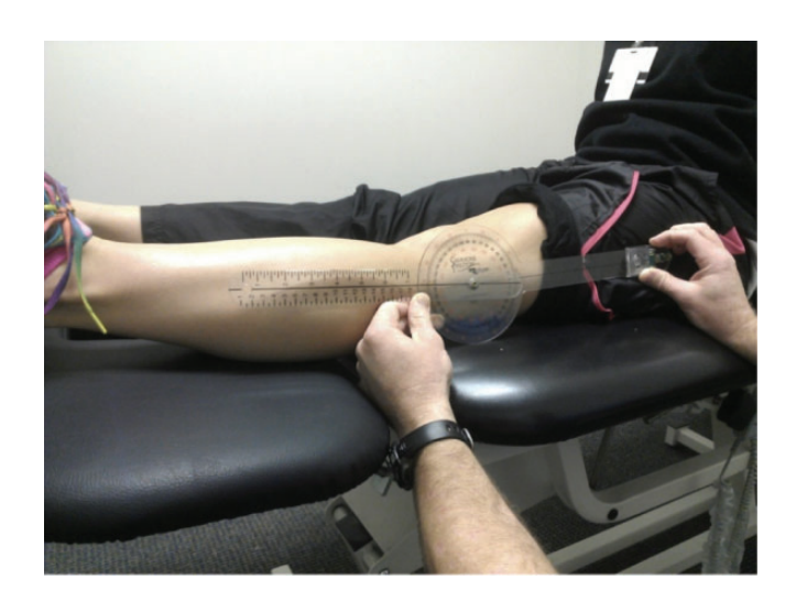
Figure 1. Use of goniometer with bubble level to measure active knee extension.

Knee extension ROM measurements were taken with a goniometer with a bubble level attachment while the patient was in a supine position with both knees in extension (Figure 1). Using a goniometer to measure knee extension has been found to have an intraclass correlation coefficient (ICC) value of 0.98 for intratester reliability and 0.99 for intertester reliability.<sup>10,27</sup> The patient was instructed to actively tighten their quadriceps and fully straighten the knee to the best of their ability, and knee ROM was measured as described by Norkin and White.<sup>17</sup> Independent of the treating physical therapist, knee extension measurements were